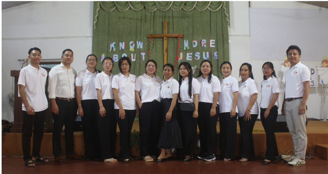
VBS Sunday School Teachers