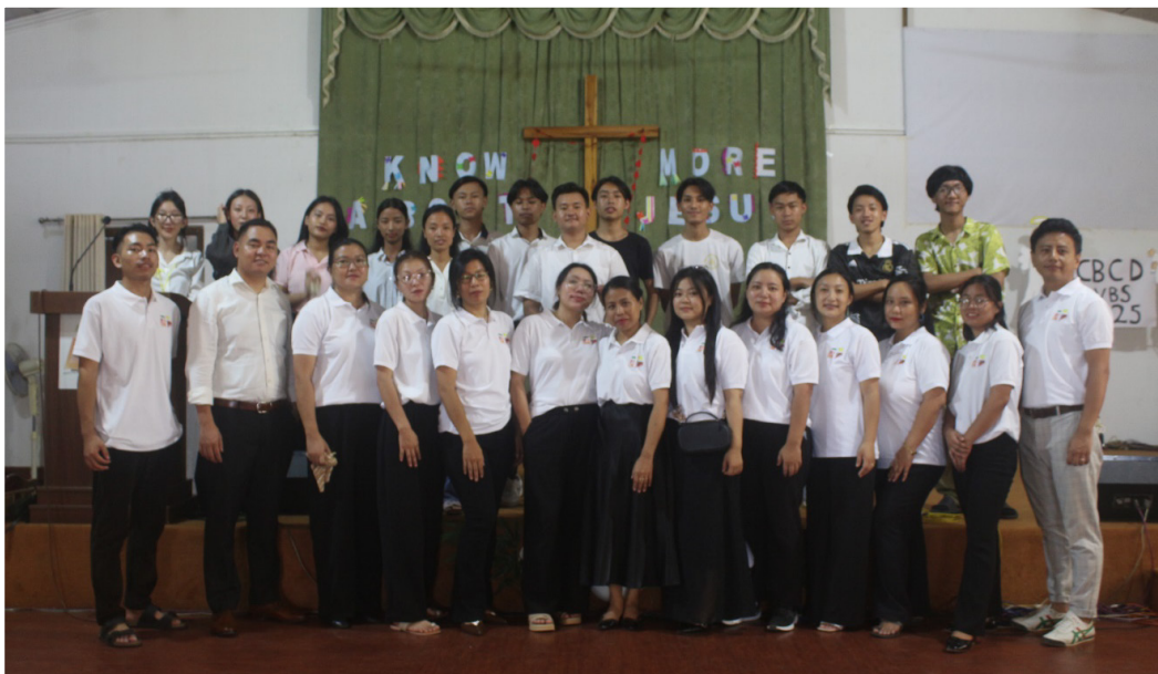
VBS Sunday School teachers and volunteers