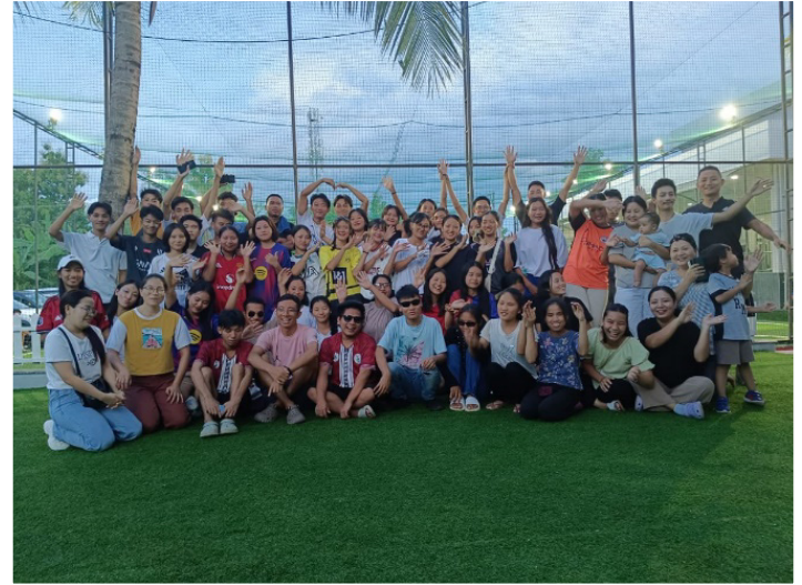
Youth Sports Fellowship at Arena 365