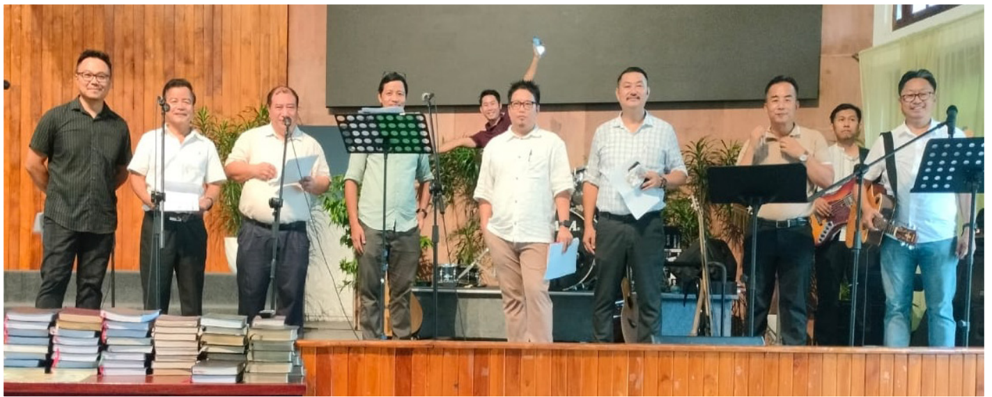
The MPB Group led the worship at Town Baptist Church's Friendship Sunday evening programme on the 3 rd of August 2025.

Anger, which is uncontrolled always destroys the clarity of mind, and affect our thoughts. Anger is as good as murder, and death brings separation, whereas forgiveness brings life, then reunites and heals. We should never take God's grace and forgiveness for granted because He shall not forgive sin that is committed out of arrogance.