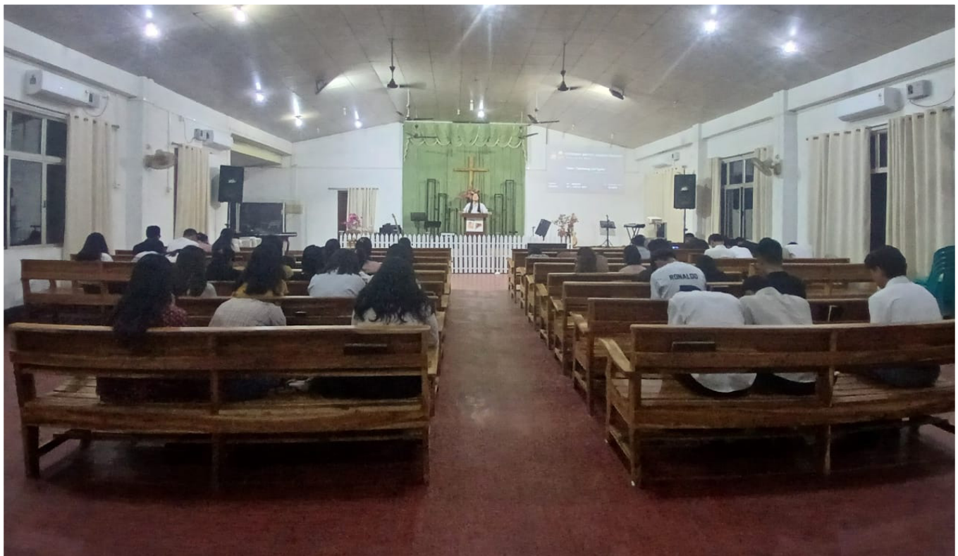
First youth service of 2026

We sincerely appreciate your prayers and support as we continue to grow and serve together for God's glory.