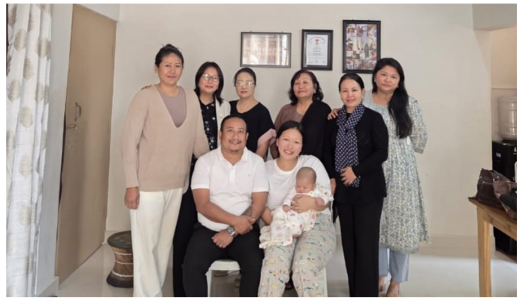
Women's fellowship home visit