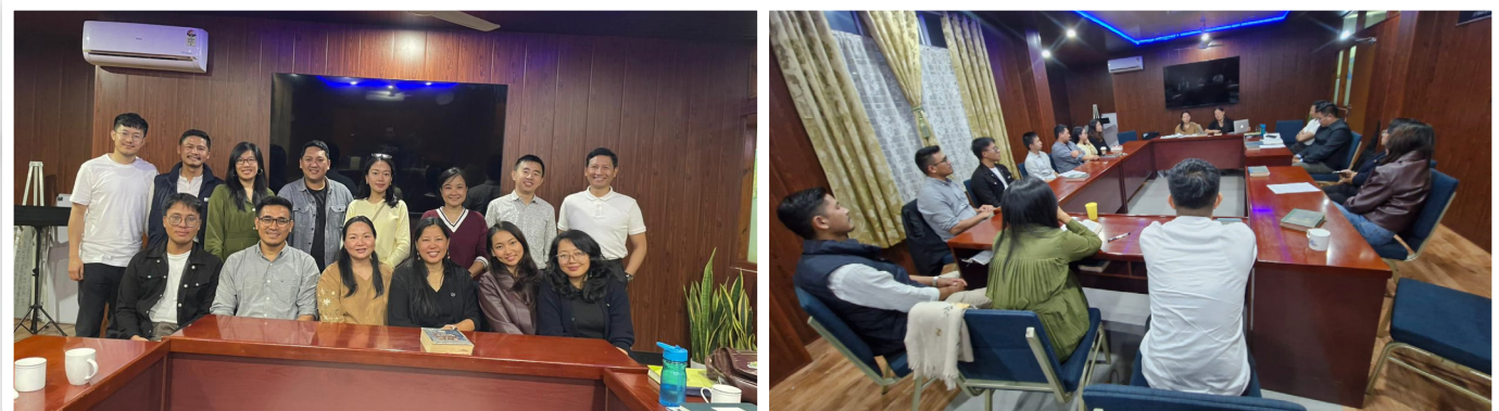
First youth service of 2026

We appreciate your continued prayers and support