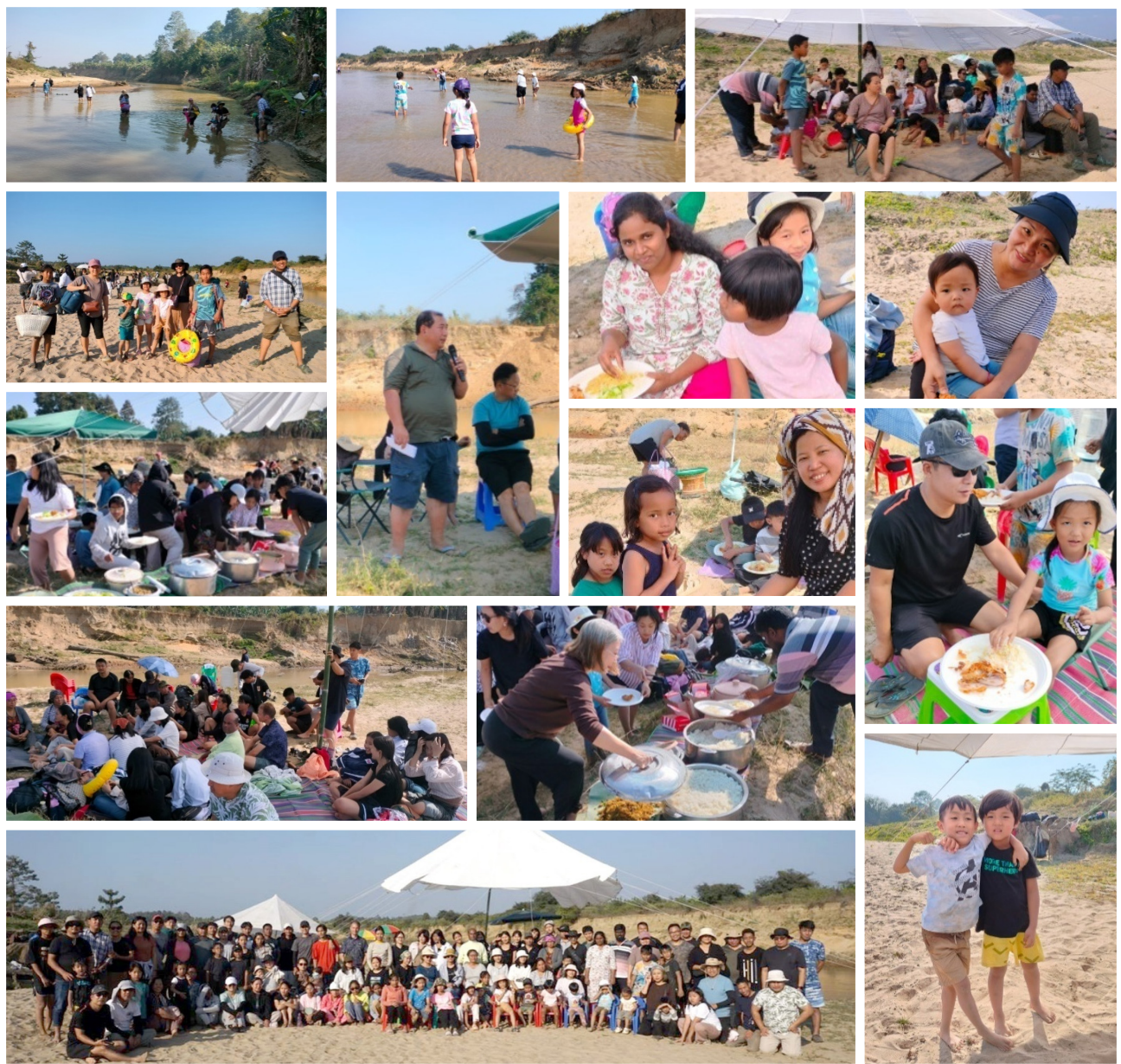
Glimpses of the Church picnic on 24 th January

The picnic concluded with a delicious lunch enjoyed by all. Members shared food in a spirit of thanksgiving and fellowship, strengthening bonds and creating memories. Overall, the church picnic was a wonderful blend of fun, fellowship, and faith. It was a day well spent in God's creation, leaving everyone refreshed and grateful for the time shared together.